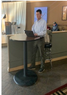
Far Left: We have a group of people who study God's word everyday.