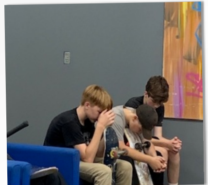
SKATECHURCH IN PRAYER