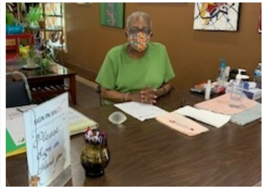
OPEN EVERYDAY FROM THE BEGINNING OF THE PANDEMIC.ELNITA: A HOPEFUL