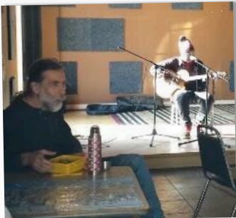
OPEN MIC IN THE CAFE FOR LUNCH. PART OF OUR HOMELESS EMPOWERMENT MOVEMENT