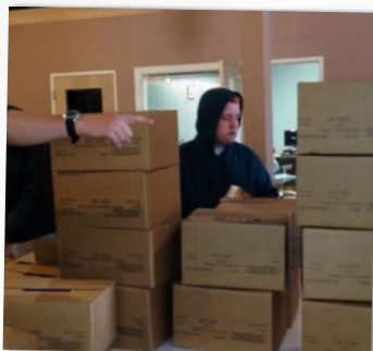
SOME OF THE HOLIDAY BOXES WE PASSED OUT TO NEIGHBORS